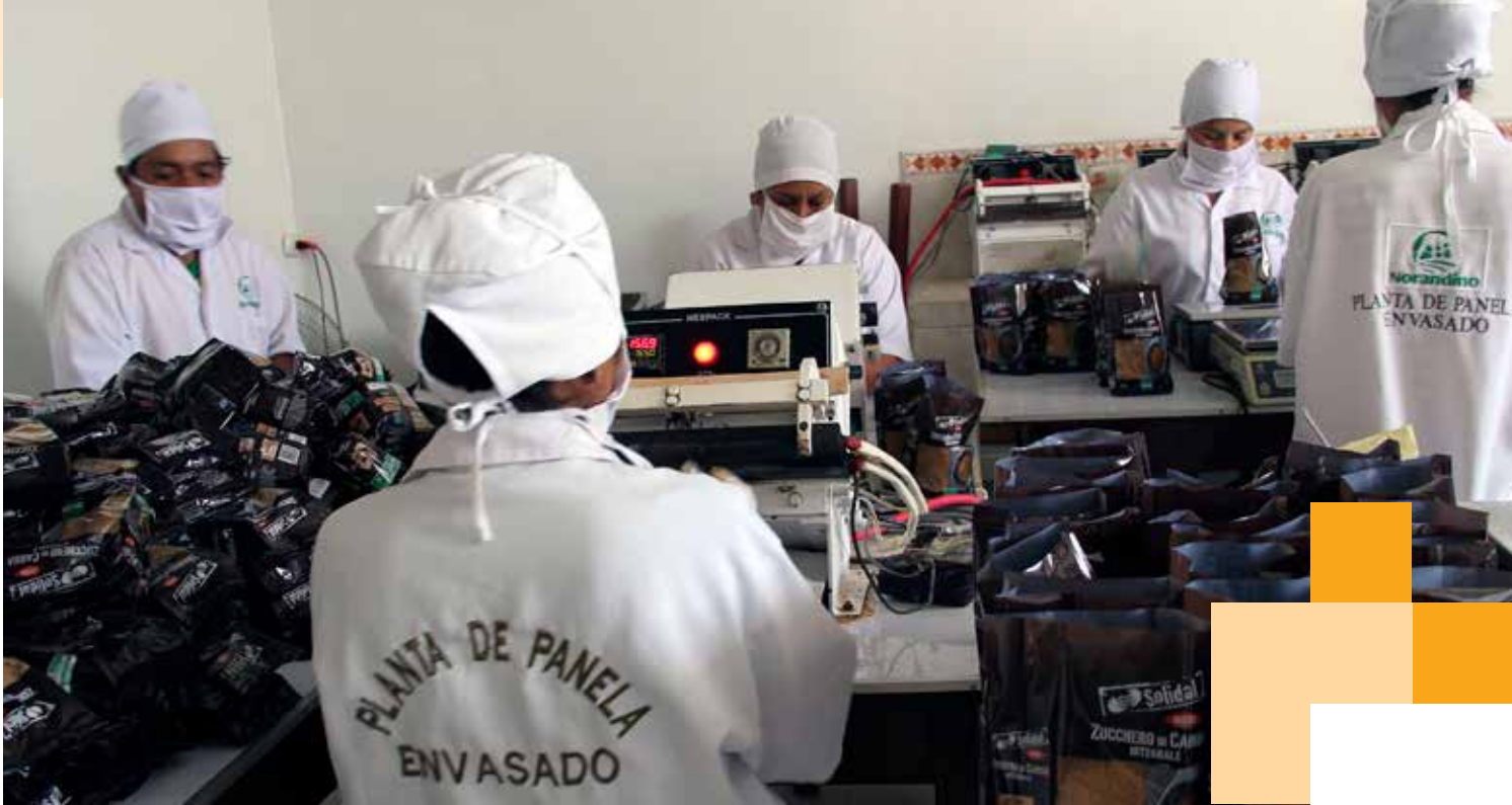
In Peru, coffee cooperative Sol & Café obtained a new credit line of $ 2,000,000 for working capital.