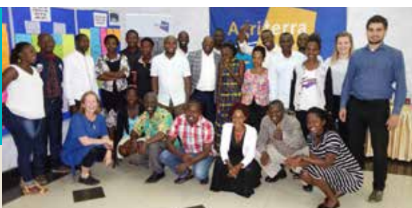
Kick-Off workshop NAJK

With the Workshop for youth participation Agriterra reached: 1 national association, 3 federations, 5 unions and 31 primary cooperatives. The workshops were given in Nepal, Vietnam, Rwanda, Uganda, Zambia, Kenya, Ethiopia and Peru.